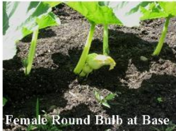
Female Round Bulb at Base