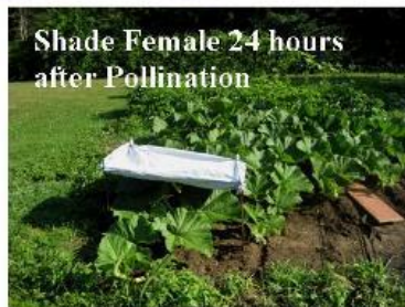
Shade Female 24 hours after Pollination