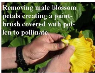
Removing male blossom petals creating a paintbrush covered with pollen to pollinate