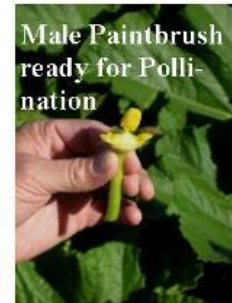
Male Paintbrush ready for Pollination