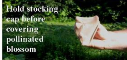
Hold stocking cap before covering pollinated blossom