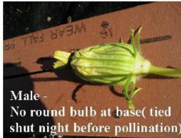
Male - No round bulb at base (tied shut night before pollination)