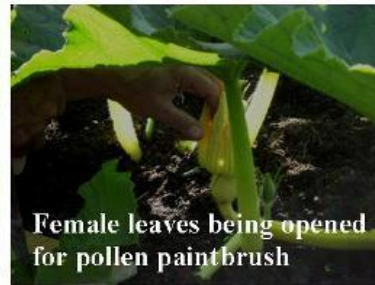
Female leaves being opened for pollen paintbrush