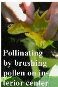
Pollinating by brushing pollen on interior center