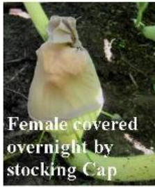
Female covered overnight by stocking Cap