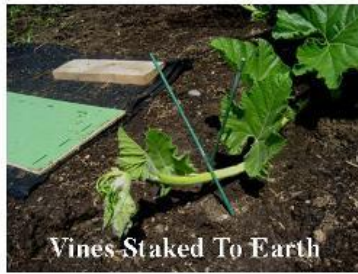
Vines Staked To Earth