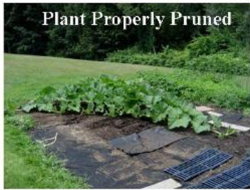
Plant Properly Pruned