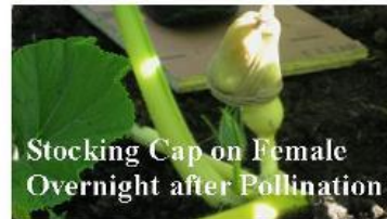
Stocking Cap on Female Overnight after Pollination